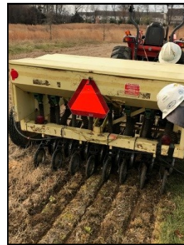
Village of Fox Meadow project. Dead invasive plants after second round of spot treatments. Wildflower meadow seed planting in December 2017.