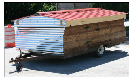
The Bellevue community garden bee resort (top photo) and the new mobile farm market stand (bottom photo)