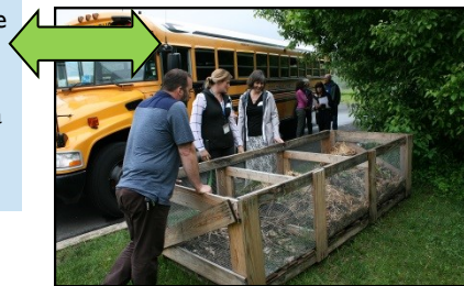
Two 3 bin compost units were installed to recycle and breakdown vegetative matter.