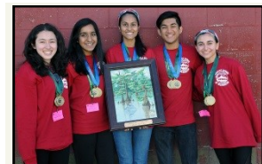
The Council is a sponsor of the Delaware Envirothon. Charter School of Wilmington Team A are state champs.

The Council is a dues paying member of the Mid-Atlantic Association of RC&D Councils and the National Association of RC&D Councils.