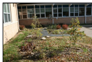
Forwood Elementary School native plant garden —native trees, shrubs, and perennials.