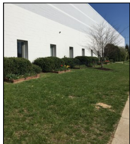
Before and after at Las Aspira Academy . The non-native shrubs were replaced with a pollinator garden.