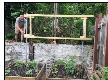
Garden beds installed at a transitional facility for women with children ( Martha's House — STEHM ).