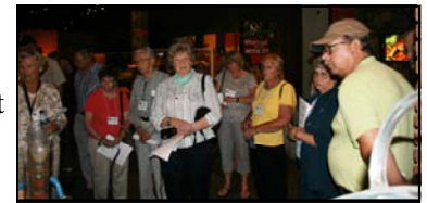
Enjoying the soils exhibit.

A number of District Employees were able to attend the 2009 NACD Northeast Regional Meeting in Solomon's Island, Maryland this past July. NACDE again played an integral role in the success of the meeting. The sightseeing tour on Sunday to the Smithsonian Museum, the State of the State session, the supervisor training session, and our annual meeting all were successful parts of the overall conference. Thanks to everyone on the Board who assisted with the annual meeting.