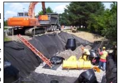
Improvements to Philbrook Avenue in South Portland, Maine using ARRA-funds included this water quality unit #6—drainage manholes and Stormtech storage chambers.