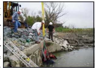
Buttonwood Marsh tidegate slated for replacement.

In Delaware , the Delaware Department of Natural Resources and Environmental Control was the recipient of ARRA funding and some of that funding was passed to the New Castle Conservation District to manage and implement several drainage and stormwater management projects. The District had worked hard to ensure that the District would be in the mix when it came to the stimulus funded projects. The ARRA funds are being used for eight stormwater pond retrofit and repairs in the city of New Castle and New Castle County. An additional five projects will include stream channel/ditch mitigation, a channeled wetland mitigation project and a new tidegate for the Buttonwood Marsh. The new tidegate will replace the current structure to allow for tidal flush in the wetland. Stimulus funds are also being used for storm sewer improvements and a new storm sewer interceptor in the city of Wilmington. The total value of the projects exceeds $2.5 million dollars. The District is responsible for project coordination which includes such things as plan review, public advertisements, reviewing bids and inspection. For more information, contact Chuck Lightfoot at Chuck.Lightfoot@state.de.us .